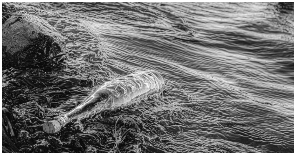
Monochrome Digital 3rd Place by Jim Spinoso