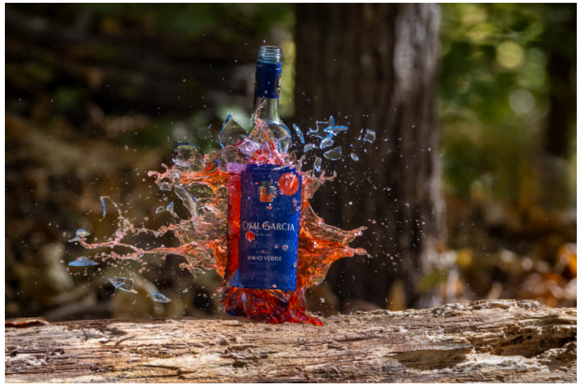
Color Digital 2nd place by Mat Bevill