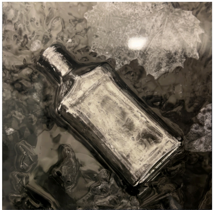
Monochrome Print 3rd place by Philip Flowers