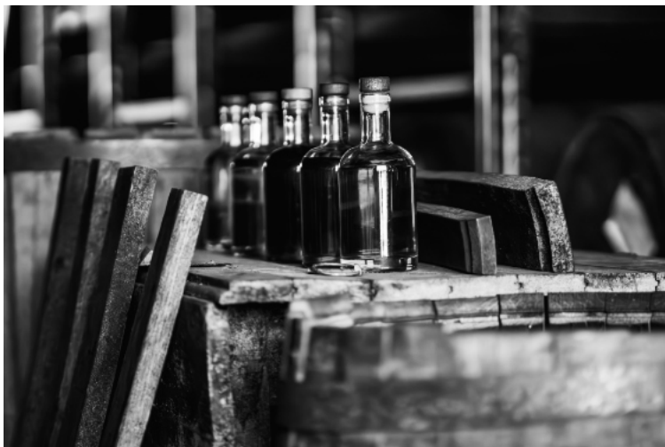
Monochrome Digital 2nd place by Trevor Hall