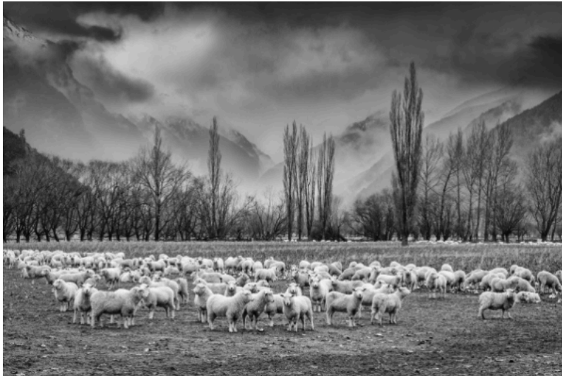
Monochrome Digital 2nd place by Emily Saile