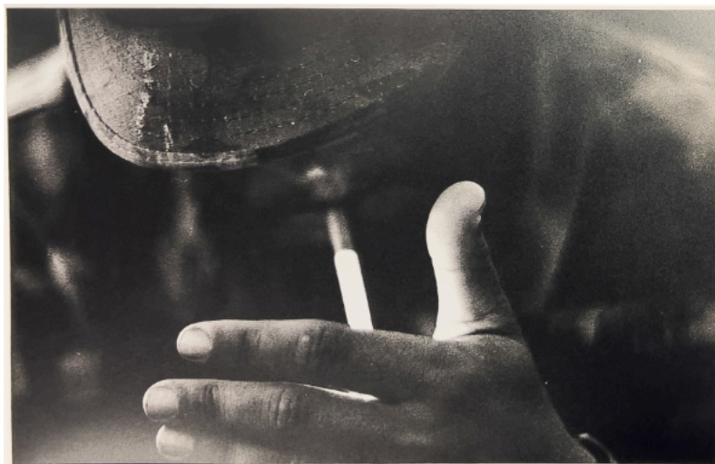
Monochrome Print 3rd place by Connor McLeod