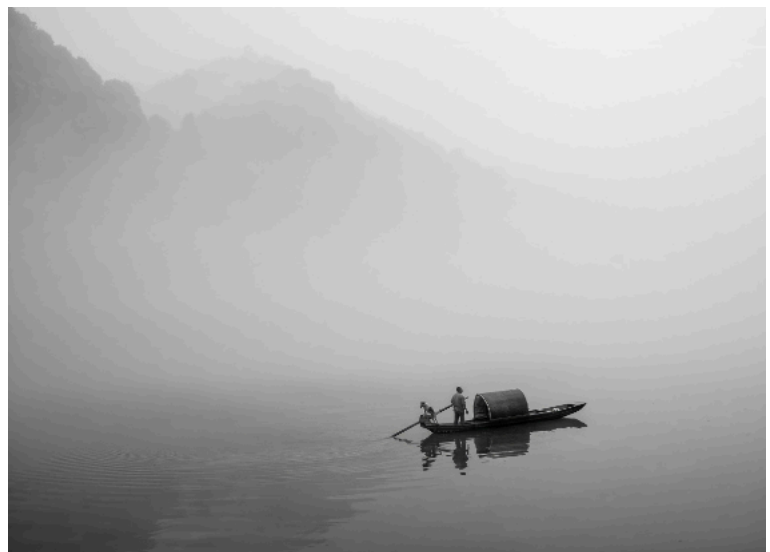
Monochrome Digital 3rd Place by C. T. Chi