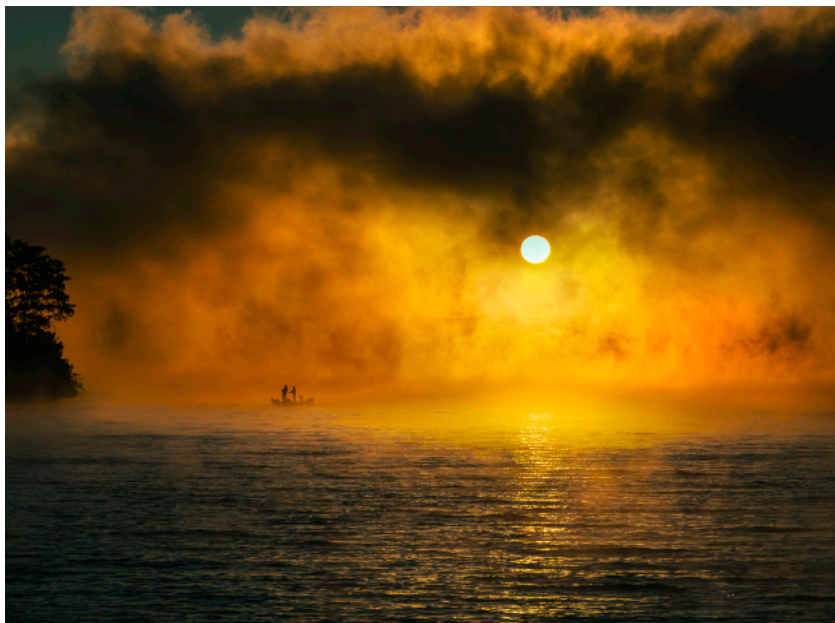
Color Digital 1st place by Jim Spinoso