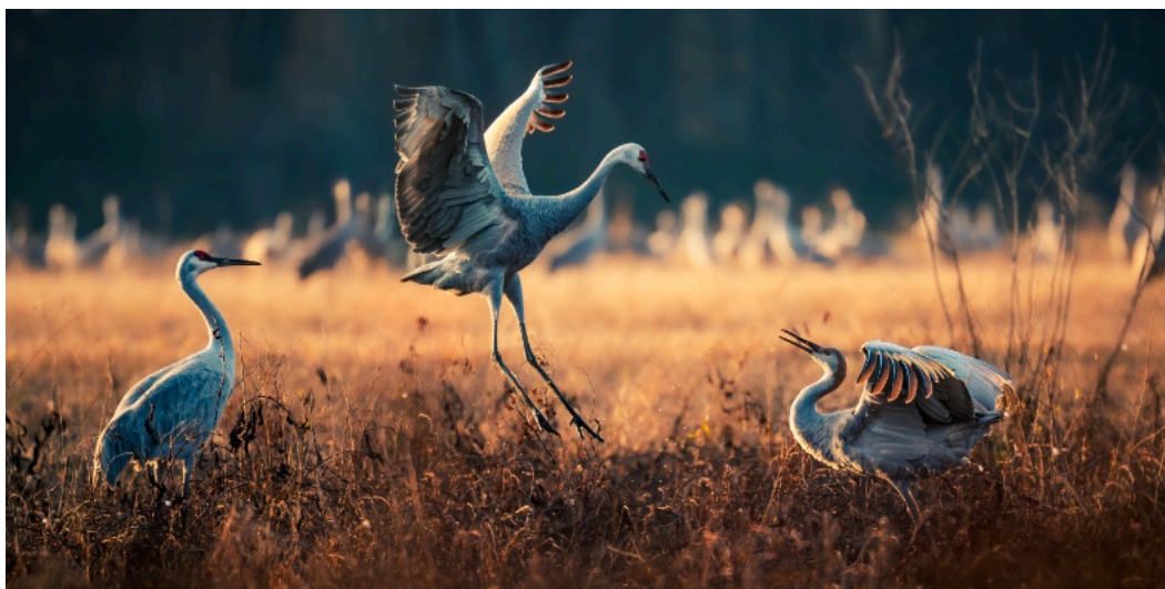
Color Digital 3rd place