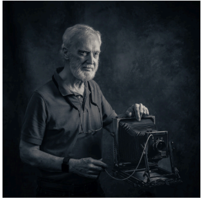
Monochrome Digital 1st place