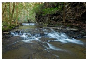
Field Trip to Fiery Gizzard near Tracy City, TN. See story, p. 6.