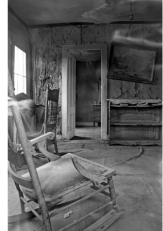
B&W Print by Ernie High